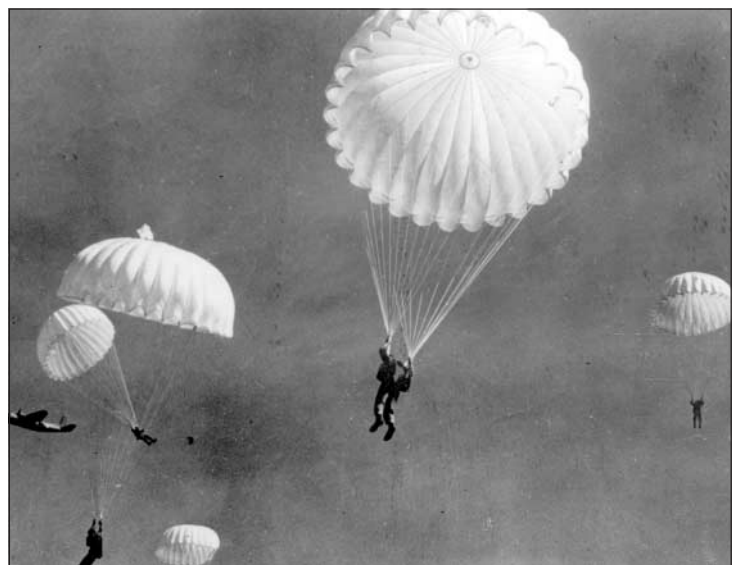
Parachutes reduce the risk of injury after gravitational challenge, but their effectiveness has not been proved with randomised controlled trials